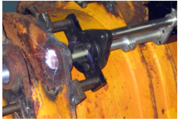
One Quick Setup - will attach to your Boring Bar Kit.